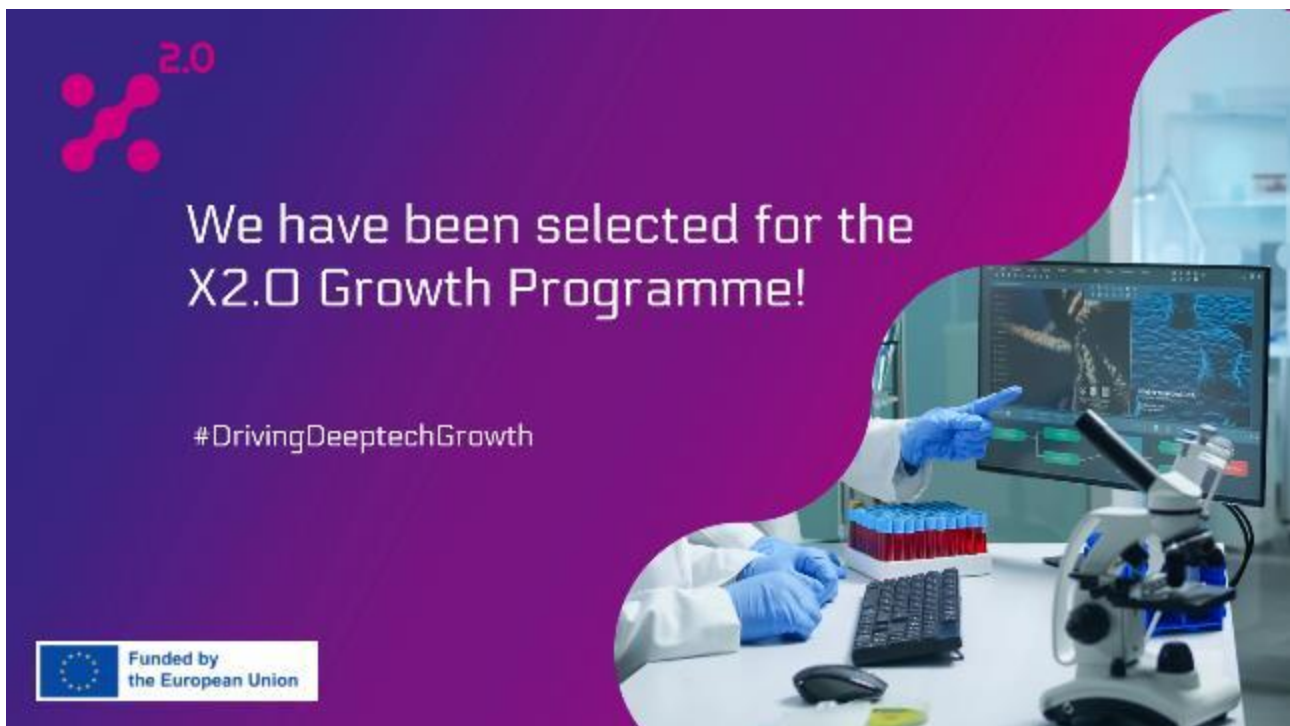
Figure 3: HealthTech & BioTech