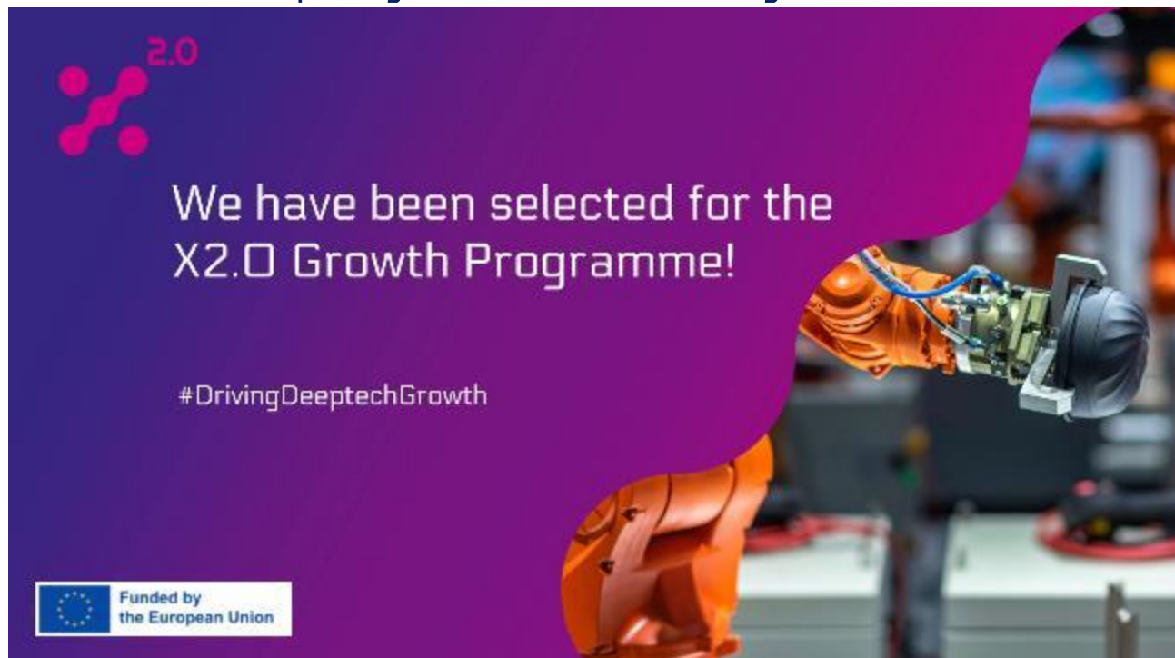
Figure 1 - Manufacturing & Circular Economy

Please use the corresponding visual based on the cohort you have been selected for: