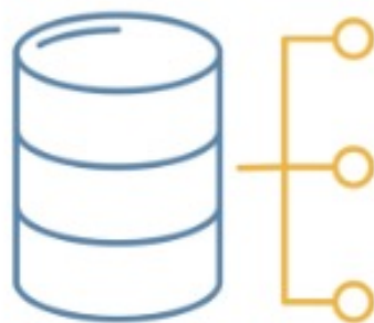
Data-driven chemical discovery