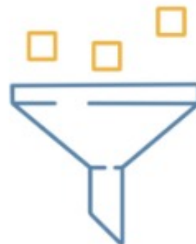
Intelligent material selection